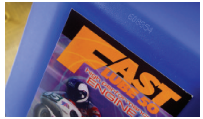
High contrast inks for dark surfaces

• Improved productivity though real-time centrally reported status and message management – without the need for any additional special software.