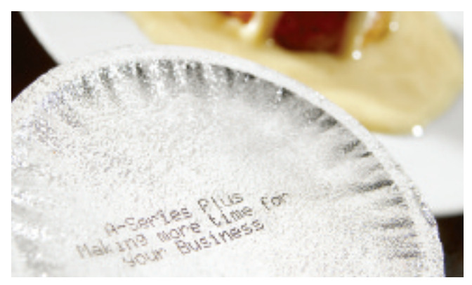
Up to 4 line coding in wash down environments

The Domino A-Series plus range of continuous ink jet printers, deliver proven performance and high reliability ranging from basic coding applications through to those requiring networking capabilities and the highest print quality in the harshest production environments.