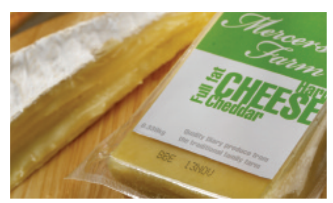
Wide variety of inks to suit modern packaging materials

The A-Series plus offers unrivalled reliability and connectivity, delivering a coding solution that provides increased production efficiencies by addressing the most common and important sources of manufacturing productivity loss.